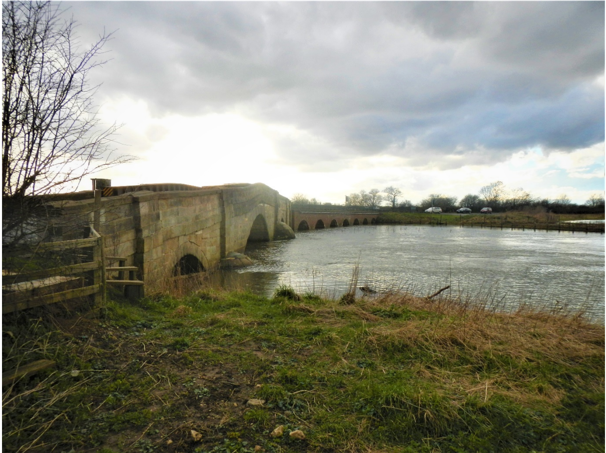
Damage caused to Bubwith bridge after being struck by vehicle on 10 September 2022